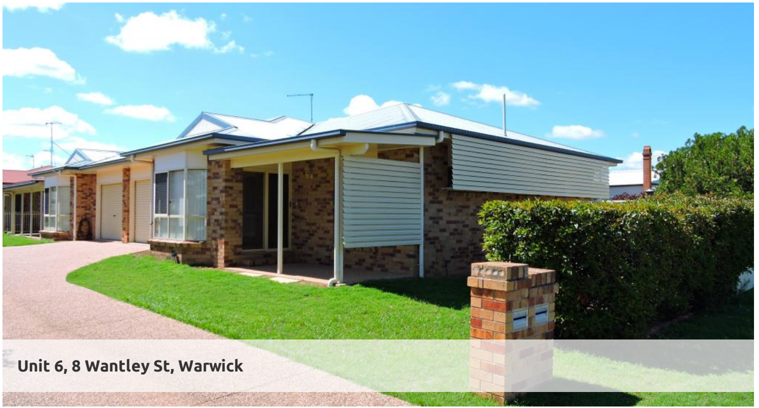
Unit 6, 8 Wantley St, Warwick